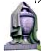
The urn symbolizes mortality. After the cross, one of the most common of funeral monuments.