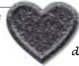
The heart symbolizes love & devotion.