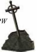
The sword represents justice or fortitude.