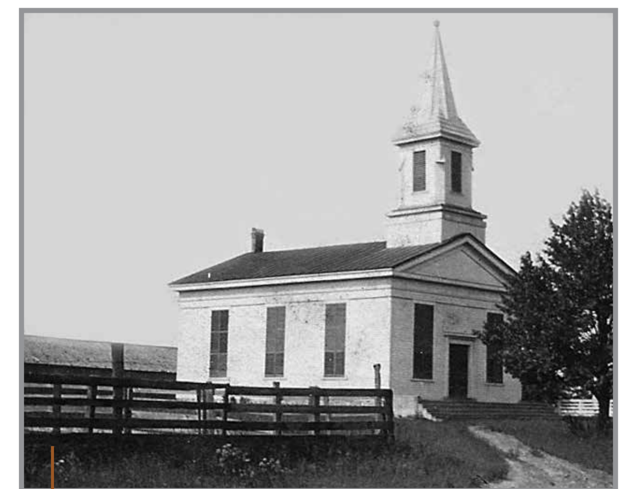
The Sashabaw Presbyterian Church, 1901. Built in 1855, it remains at its site along Maybee Road east of Sashabaw Road, across from the current active church.