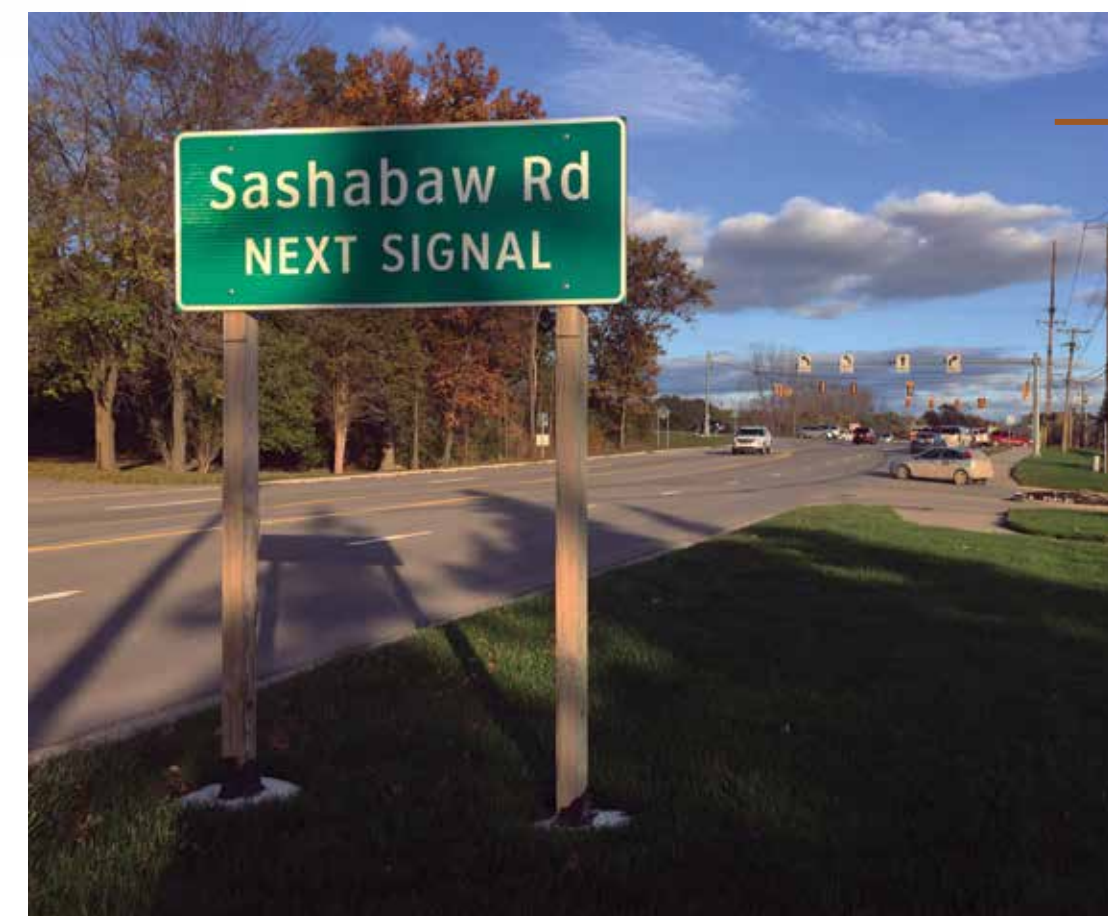
Sashabaw Road is a north-south route that has become a commercial corridor on the east side of Independence Township.