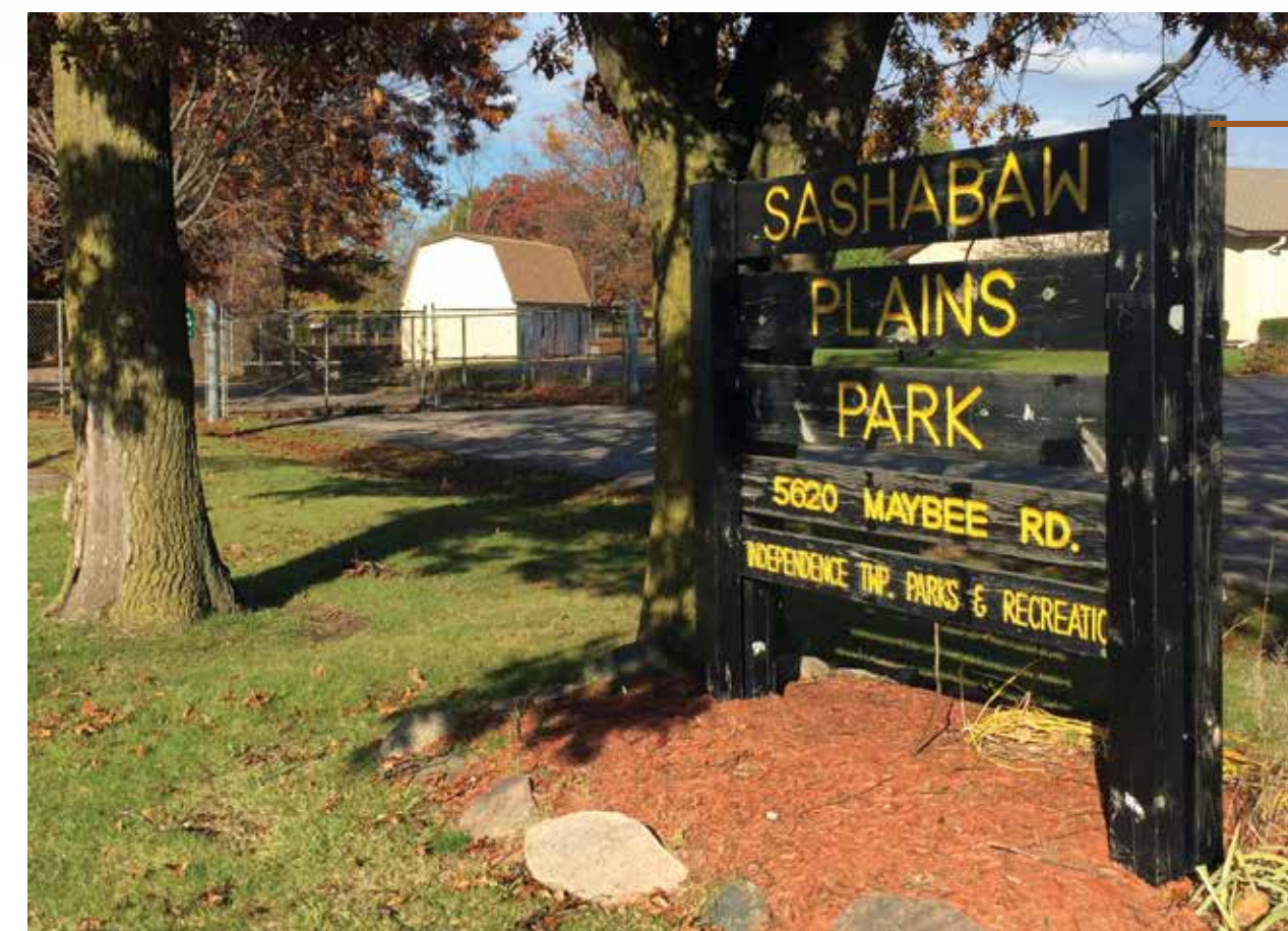
Sashabaw Plains Park, on Maybee Road east of Sashabaw Road, is in the middle of the flat land south of Pine Knob that has been called the Plains of Sashabaw.