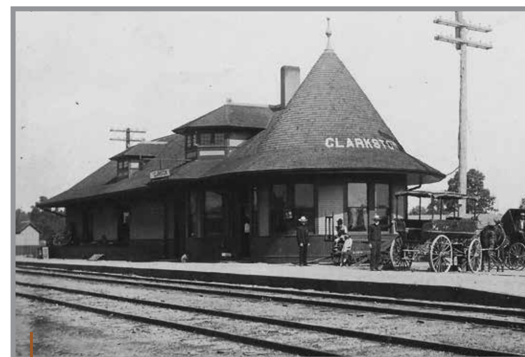
The "witch's-hat" style depot was built about 1900, and it replaced the original 1850s depot that burned down.