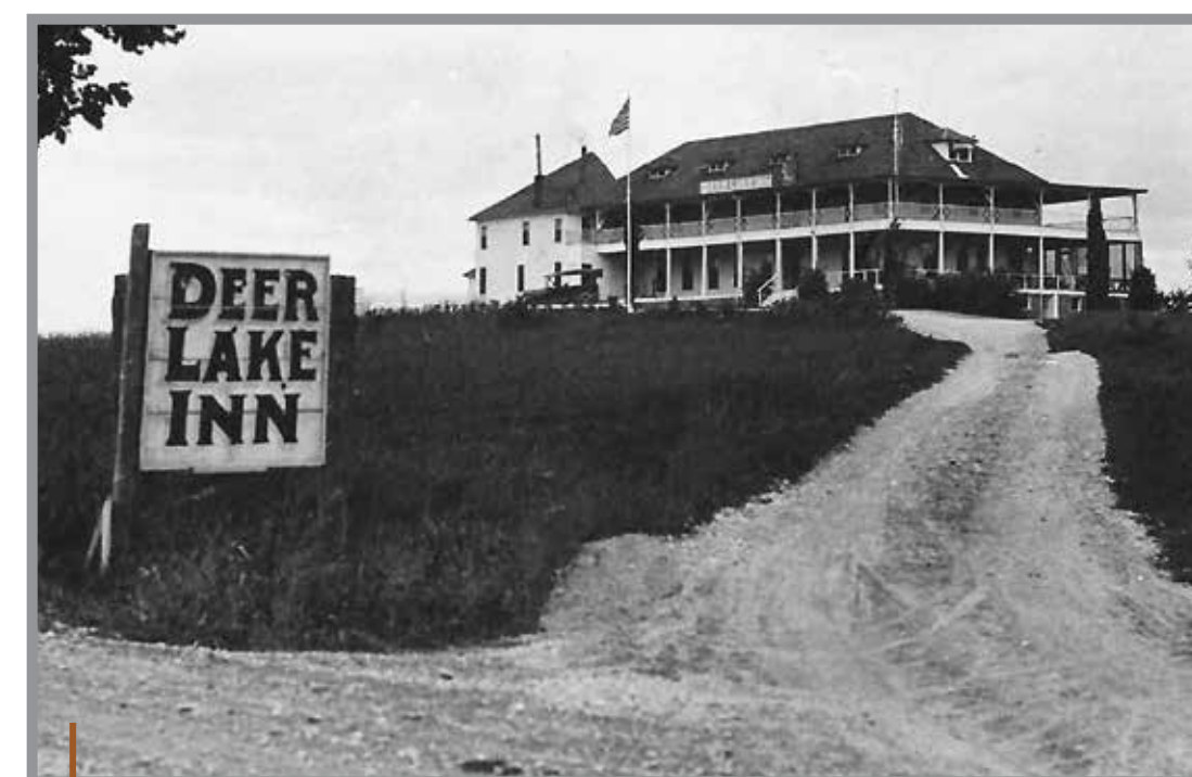
The Deer Lake Inn was one of the area's most popular resorts of the late 1800s and early 1900s. Tourists visited the inn by train, or by car via Dixie Highway.