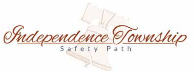
Exhibit sponsored by