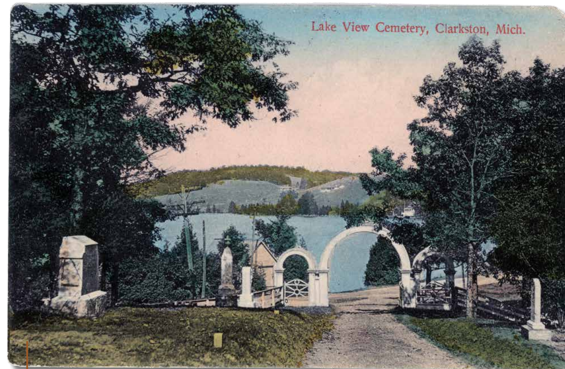
In this 1909 postcard, the entry gate of Lakeview Cemetery faces Depot Road and Deer Lake. This photo was taken from inside the cemetery gates.