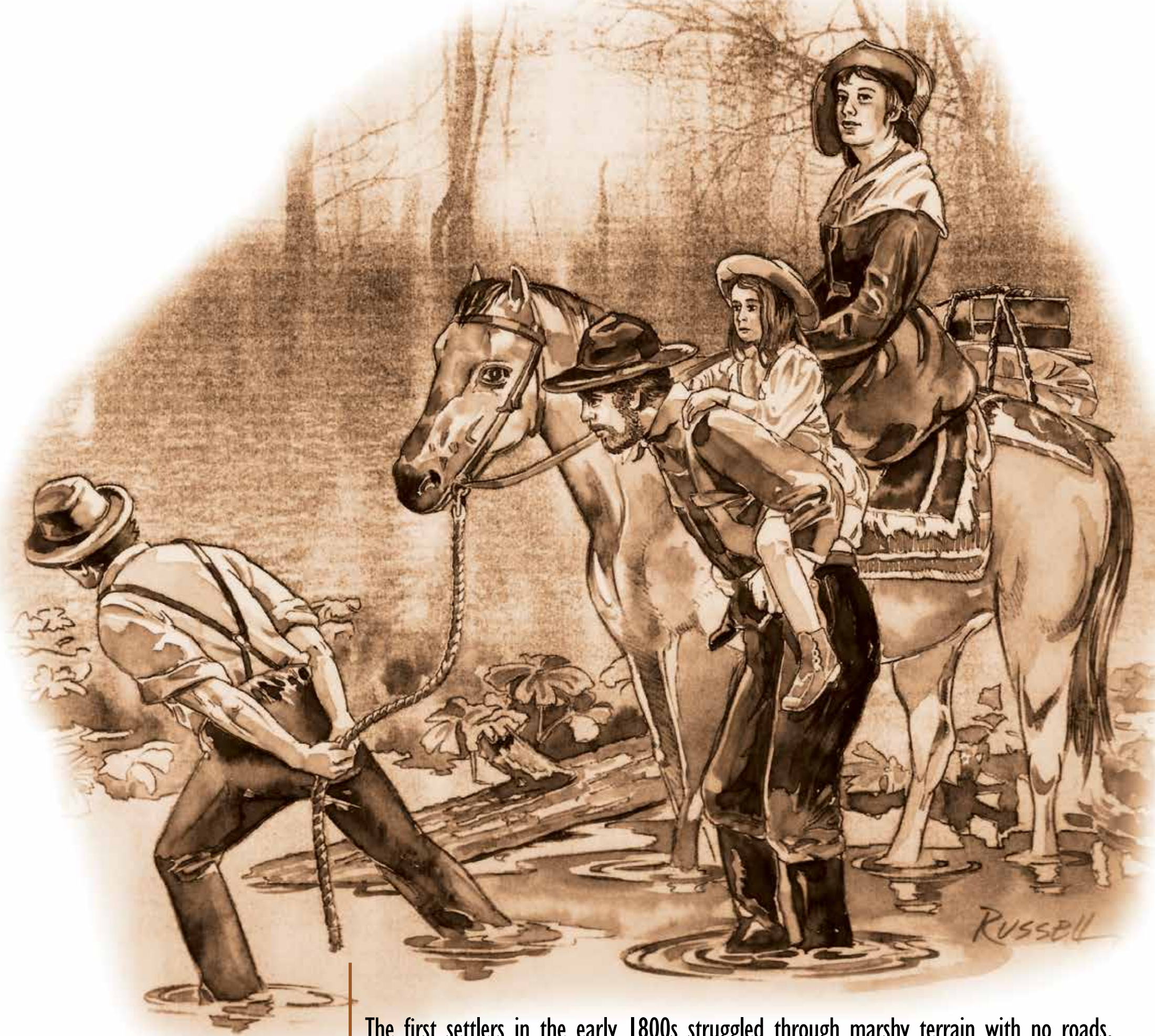
The first settlers in the early 1800s struggled through marshy terrain with no roads. Illustration by James Russell. All images, other than the 1817 township survey map, are courtesy of the Clarkston Community Historical Society.

through this wooded region, used by Native Americans. In the 1820s, the trail became the first road in the region for travel from Pontiac through the southwest corner of Independence Township and on to Saginaw. It was vital to the settlement and growth of the area, and came to be called Dixie Highway. When the first railroad and depot were built nearby in the 1850s, Depot Road became the main link to Clarkston for mail, shipping and travelers. As automobiles became common in the early 1900s, paved roads gave drivers better access to the attractive businesses, homes and recreation of Independence Township.