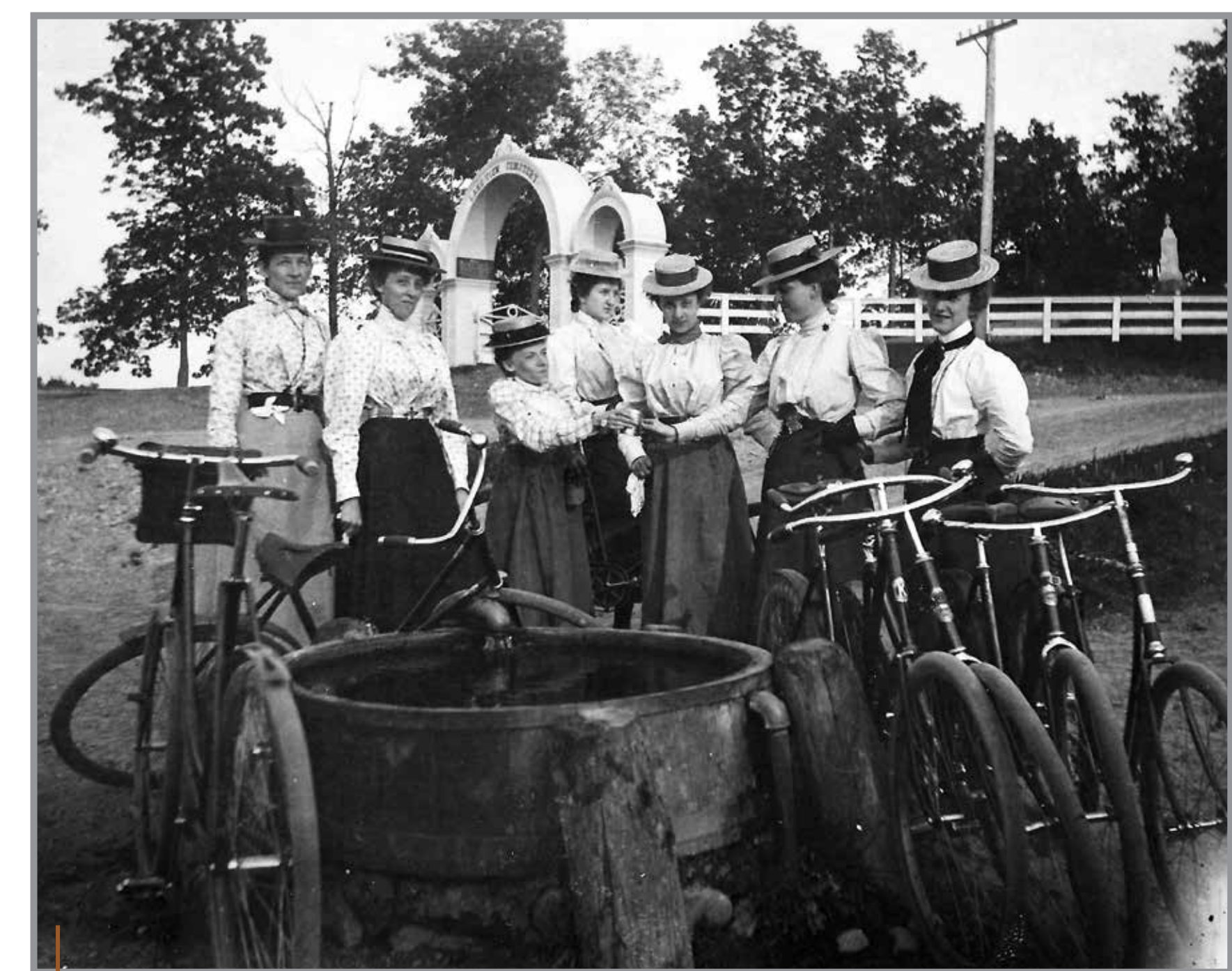
Bicycle travelers pause for refreshment at the spring in Depot Road in front of the cemetery gate, about 1900. The spring was a popular milestone for travelers in the area.